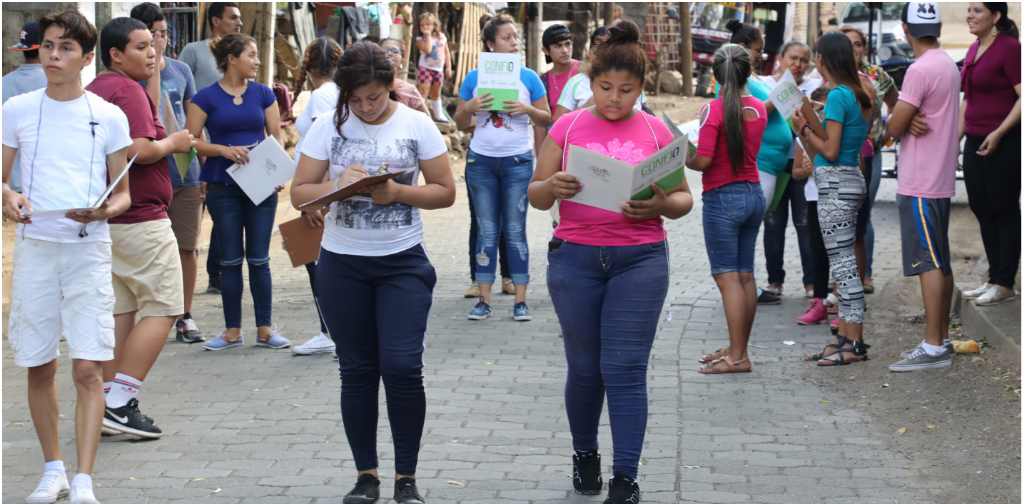
Youth lead the design and implementation of community campaigns to share awareness-related messages about the risks of irregular migration in schools and other community centers.